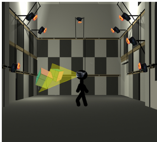
Fig. 1 Motion capture actor in a futuristic virtual environment supporting the actor's work

For the depicted environment we have to know that different stakeholders and also different ethical fields come together. Actors, directors, game developers and game publishers are interested in the results of a motion capture shoot. While acting, the fields of computer games and virtual environments come together to support the actors with their work. The goal of all stakeholders is to deliver realistic and natural-looking animations. Game developing companies get their demand from the market, generally speaking from computer game consumers. In this market it seems to be a trend that gamers seek to play games that are increasingly realistic in terms of movements and emotions. So it is in the interest of the gaming industry to support the needs and wants of realism that gamers seek and pay for.