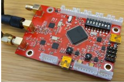
Fig. 1. Hardware for positioning element-out-of-context.