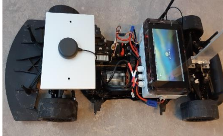
Fig. 2. Scale model of an Automated drive capable vehicle used for testing.

Fig. 1 shows the hardware for the positioning element. It contains a satellite navigation receiver which is used in conjunction with correction data for enhanced precision (real-time kinematic positioning). The correction data is streamed over an Internet connection. Together with data from an inertial measurement unit (IMU) and odometry a position can be calculated, with a quality-measure of that position [9].