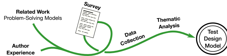
Fig. 1. Overview of the method used for collecting data and developing the problem-solving model of test design.

with a theory of the mental images and processes that produced them. The questions were defined as procedures that evaluate the coherence and accuracy of a person’s developing mental model, while the hypotheses were identified as a planning process that draws on various forms of knowledge.